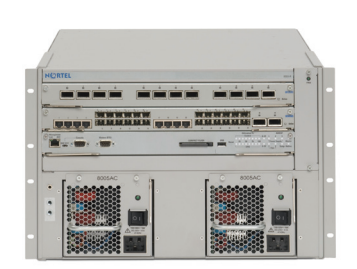
ERS 8800 3-Slot Switch

The ERS 8800 reduces complexity and risk in network design by simplifying the network architecture and increasing value with advanced features on high-density modules. High port density, combined with rich capabilities and leading reliability