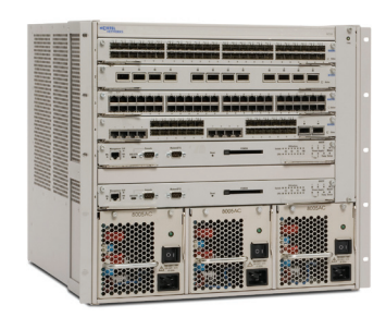
ERS 8800 6-Slot Switch